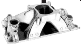
SINGLE PLANE H.P.